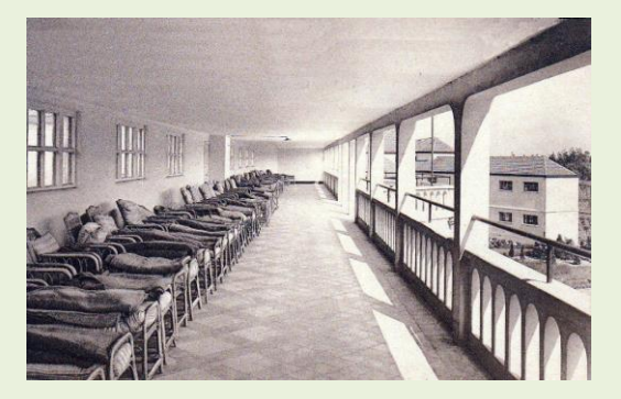
Good for recovery when the weather is fine but not so good in November perhaps.