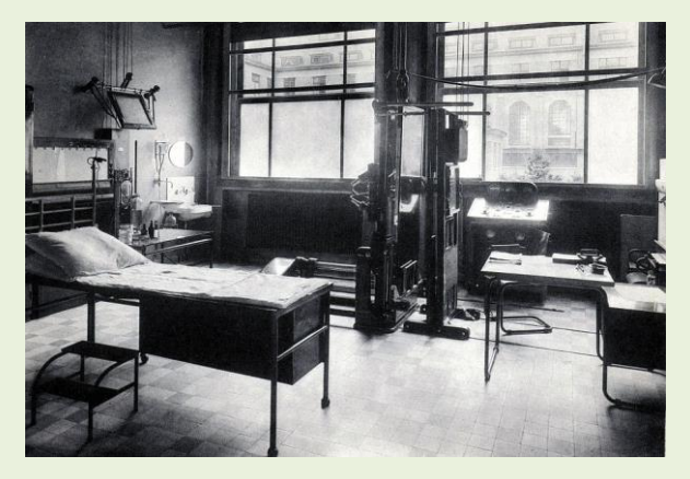
Early Radiation department.