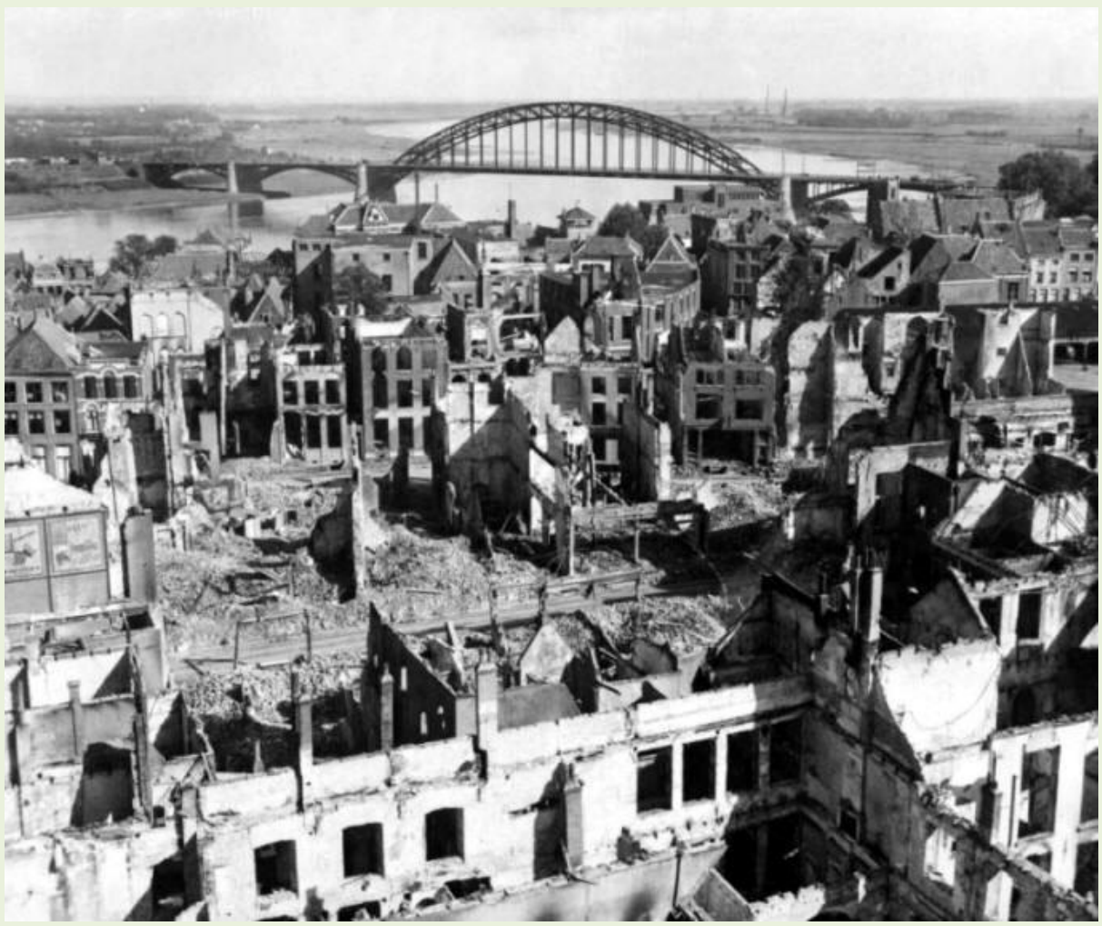
Nijmegen and the bridge in late September, after the battle.

The 8th Armoured Brigade moved to the area of Nijmegen were the bridges over the River Vaal had already been captured by 82<sup>nd</sup> USA Airborne Division supported by the Guards Armoured. Ahead of them though, in the Arnhem area battle still raged. Shortly after arriving in the area rations ran very short due to the cutting of a supply route. You cannot fight without rations and supplies, emphasising the importance of supporting troops. Because the situation was so bad and as it was known that there was a German Army food dump at Oss, 555 Company Royal Army Service Corps were ordered to go and relieve them of their store. This they did but not without a serious struggle in which they were assisted by the Guards Armoured Division. As they were leaving with the supplies they were asked by the German Officer in charge to sign for what they were taking, they did this with pleasure.